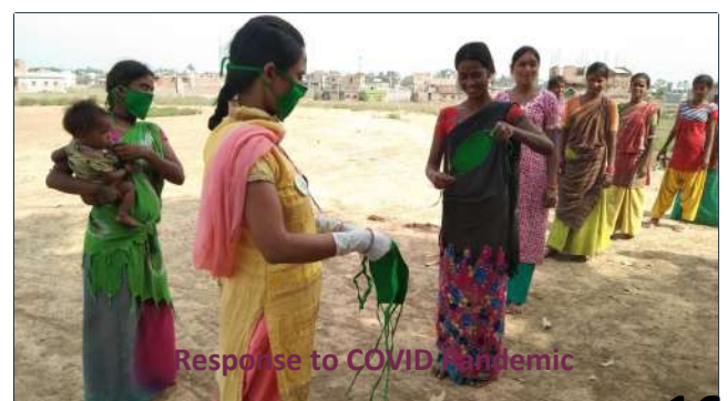
Response to COVID Pandemic