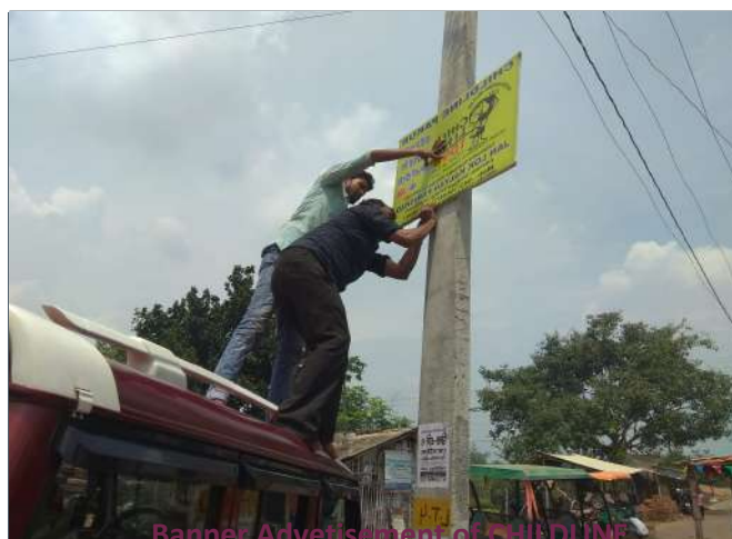
Banner Advertisement of CHILDLINE