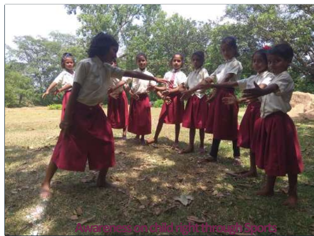
Awareness on child right through Sports