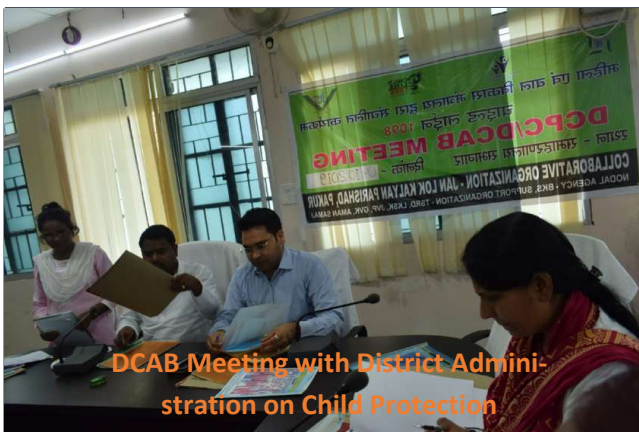
DCAB Meeting with District Administration on Child Protection