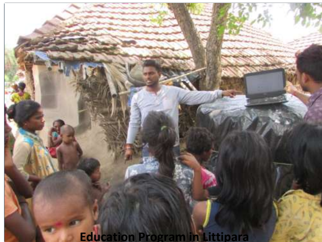
Education Program in Littipara