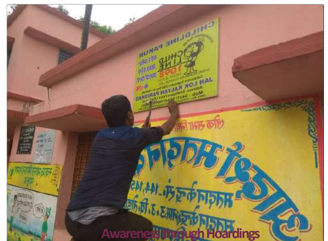
Awareness through Hoardings