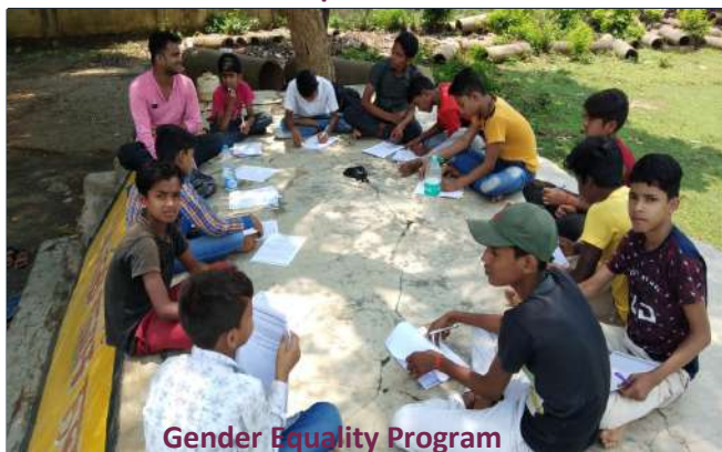
Gender Equality Program