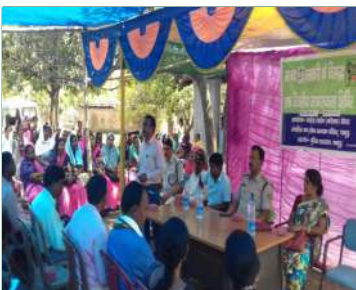
Emergency CHILDLINE Service for the Passengers rang on 1098