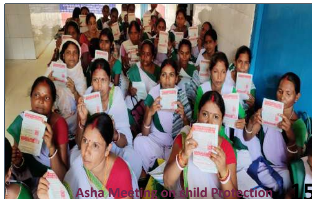
Asha Meeting on child Protection