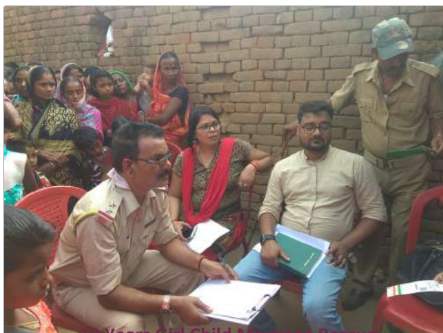
12 Years Girl Child Marriage Rescue Operation