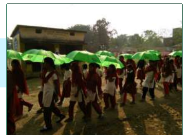
Awareness program in Pakur district against Human trafficking.