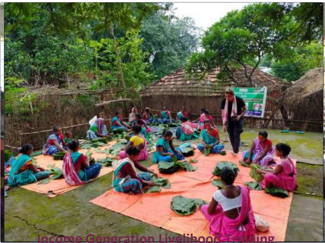
Income Generation Livelihood Training