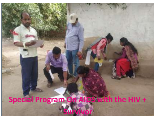
Special Program On AIDS with the HIV + Survivor