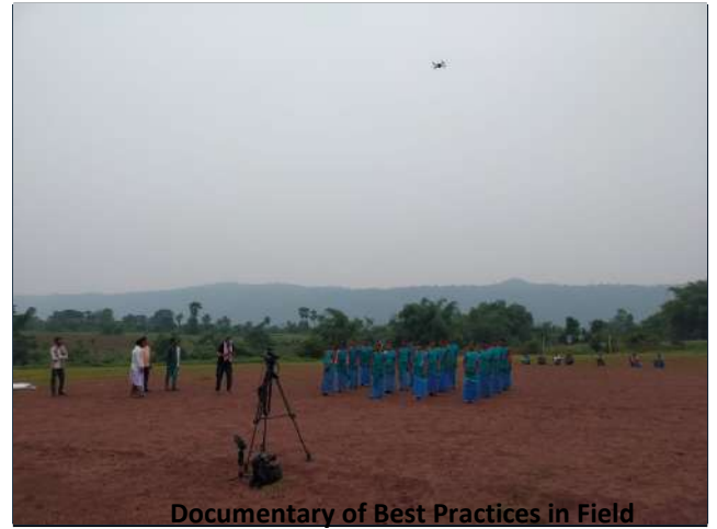
Documentary of Best Practices in Field