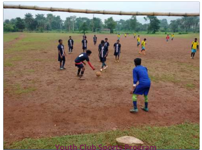
Youth Club Sports Program